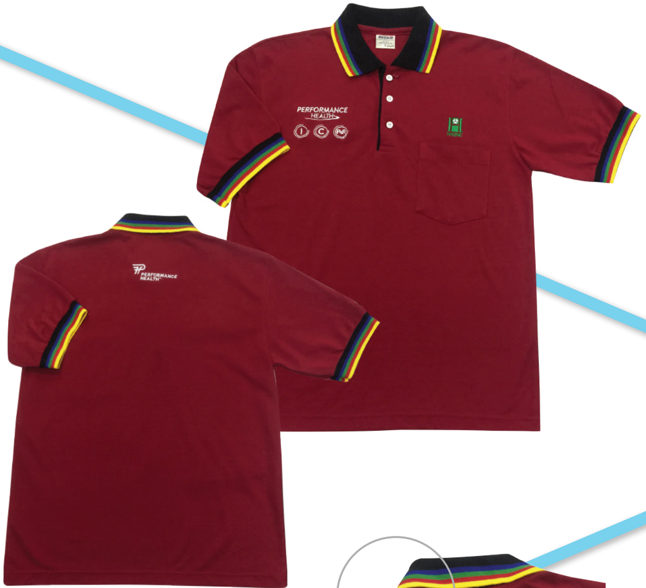
Collars & Cuff