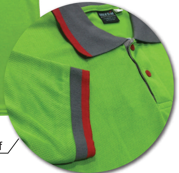
Variety Color Cuff