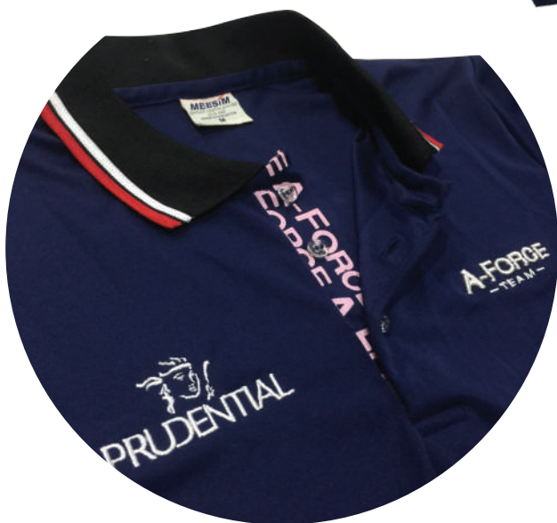
Customized Silkscreen Printing