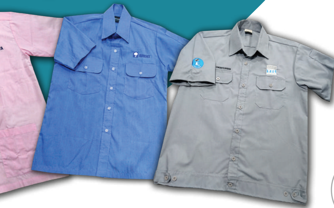
Double Layer Sleeve