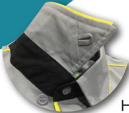
Hidden Button Hook